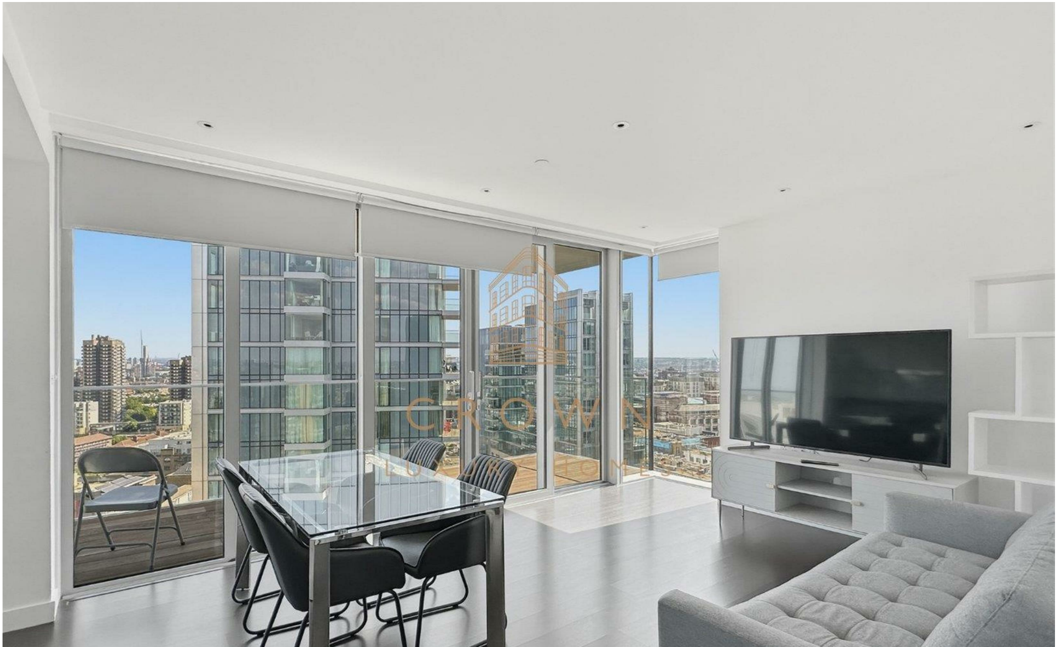
Apartment 1801, 84, Meranti House Alie Street, London, E1 8QD £3,600